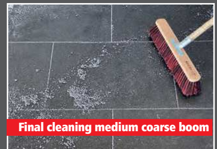
Final cleaning medium coarse broom