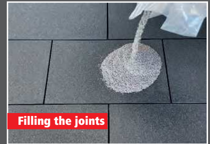
Filling the joints